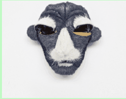
Noon Passama, brooch: Portrait #17